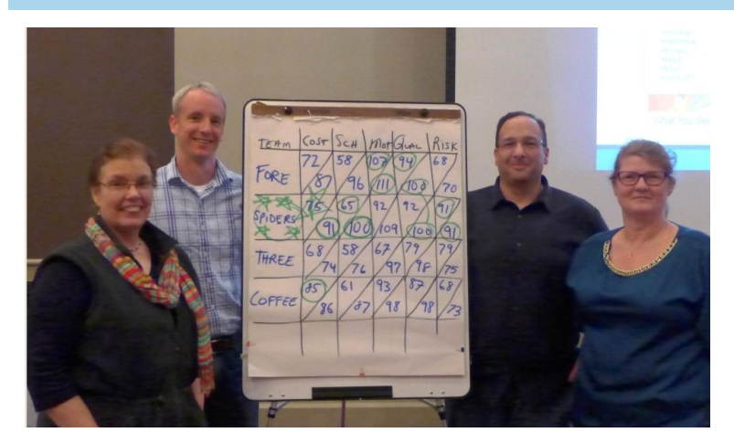
Congratulations to the Spider Team – Winners of the PDD PM Competition on Saturday September 19th